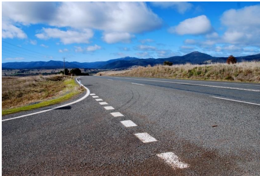
Intersection of Buttercup Road and Mount Buller Road looking east towards Merrijig – 213 metres Safe Intersection Sight Distance

Sight Distances measured five metres back from the give way line at a height of 1.25metres. (Ref: Austrroads Guide to Road Design Part 3 Geometric Design Chapter 5 Site Distance specifications: Australian Guide to Road Design Part 4a Unsignalised and Signalised Intersections Chapter 3 Site Distance ).