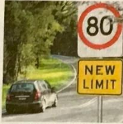
Down, down: Speed limit reductions may be considered.

out a cut to either the country default or the freeway limit when questioned by The