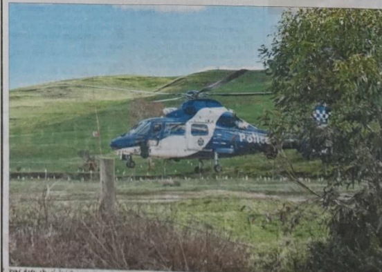
ON AIR: Victoria Police Air Wing division were at Merrijig to give a helping hand to Mansfield Highway Patrol during Operation Early Bird.

He advised that Operation Early Bird will again be conducted this next weekend.