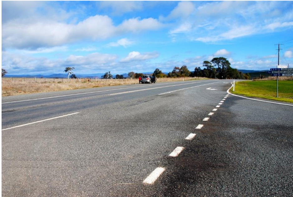
Intersection of Buttercup Road and Mount Buller Road looking west towards Mansfield – 178 metres Safe Intersection Sight Distance