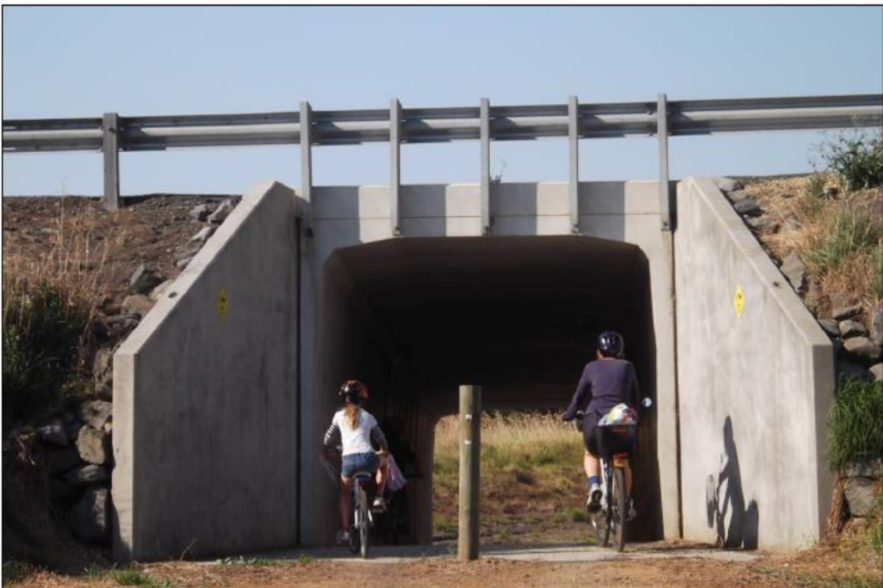
Potential grade separation under Withers Lane with the rail trail returned to original alignment