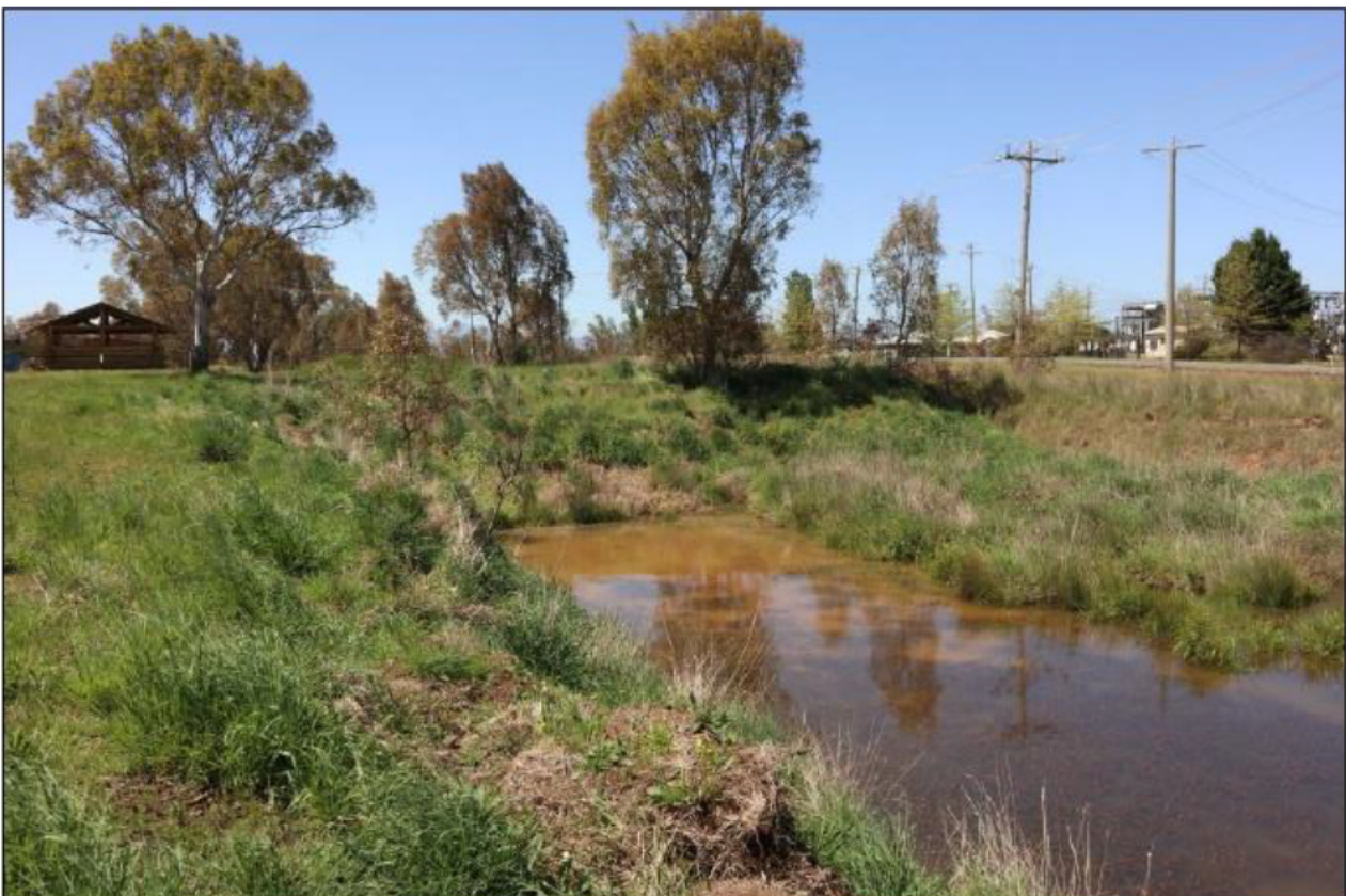
Original rail alignment looking East towards Withers Lane, October 2017