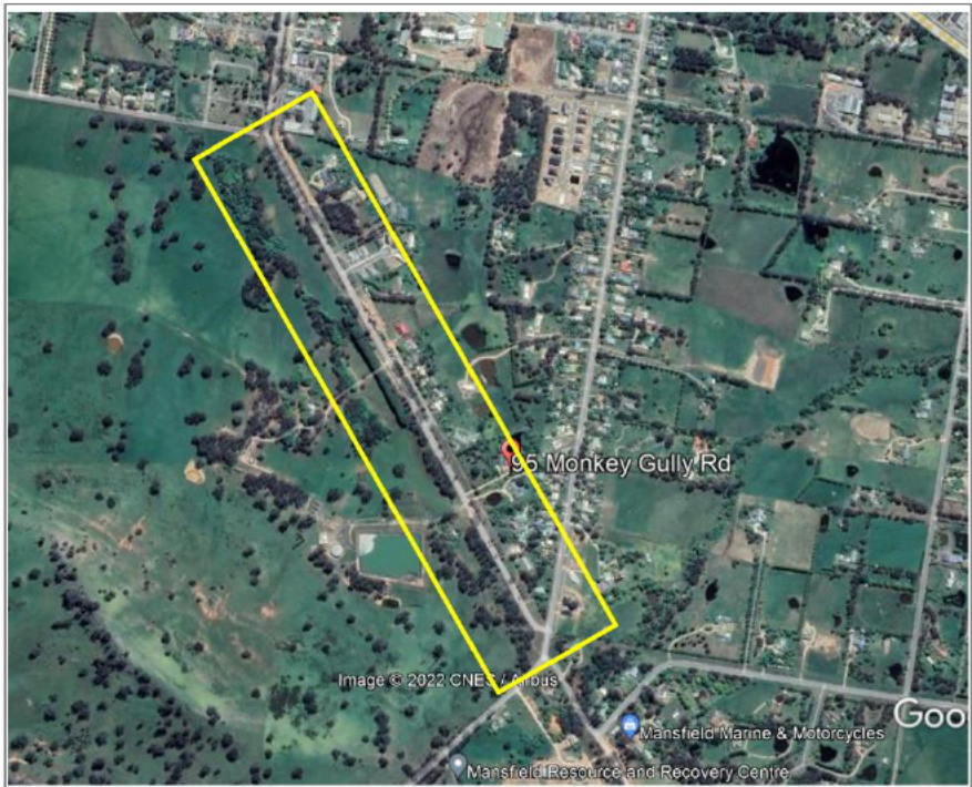
Monkey Gully Rd, Mansfield