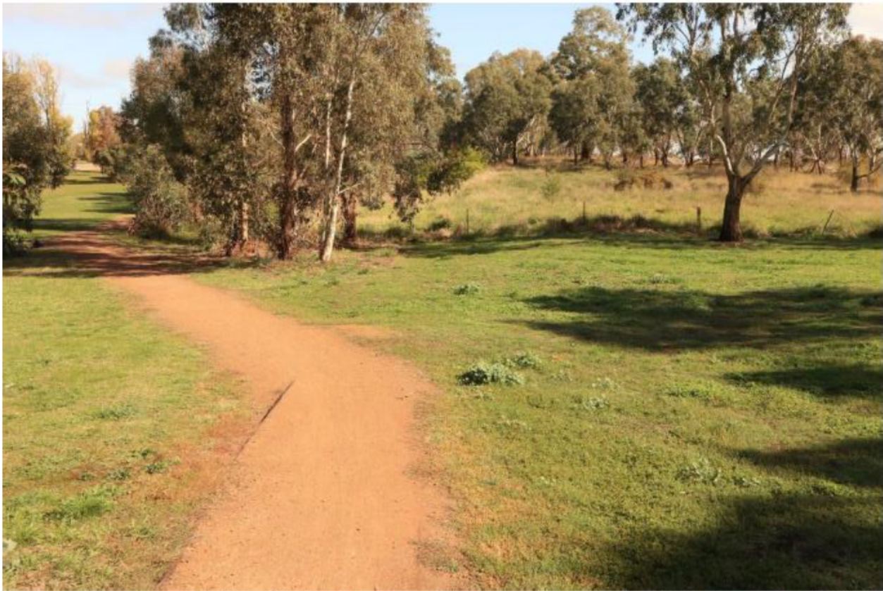
Looking West from Mullum Wetlands where rail trail leaves original rail alignment, April 2020