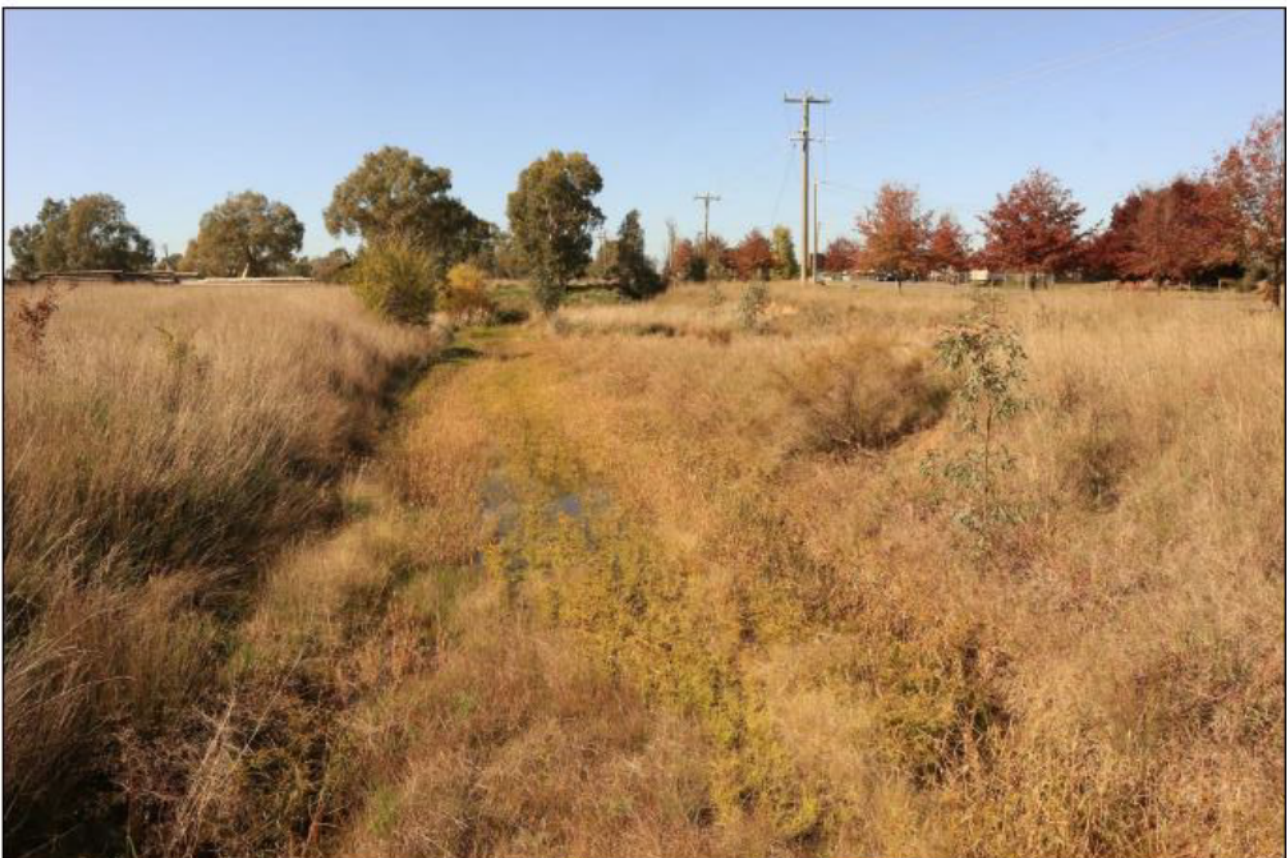
Abandoned rail alignment leading towards Withers Lane, April 2020