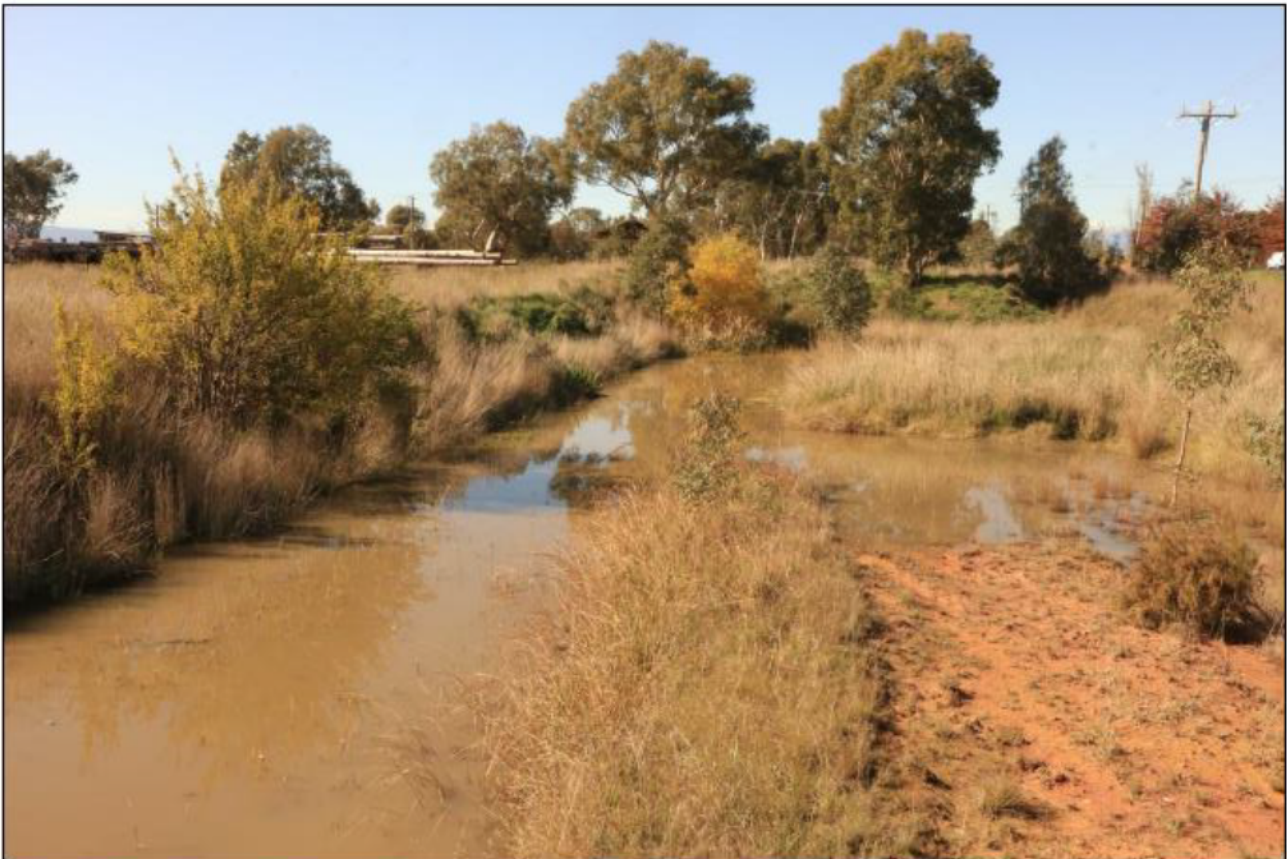
Original rail alignment West of Withers Lane with Great Bear Log Homes on left, April 2020