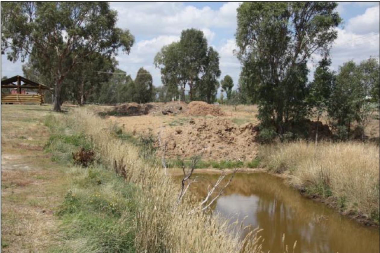
Original rail alignment cutting looking East towards Withers Lane, February 2015