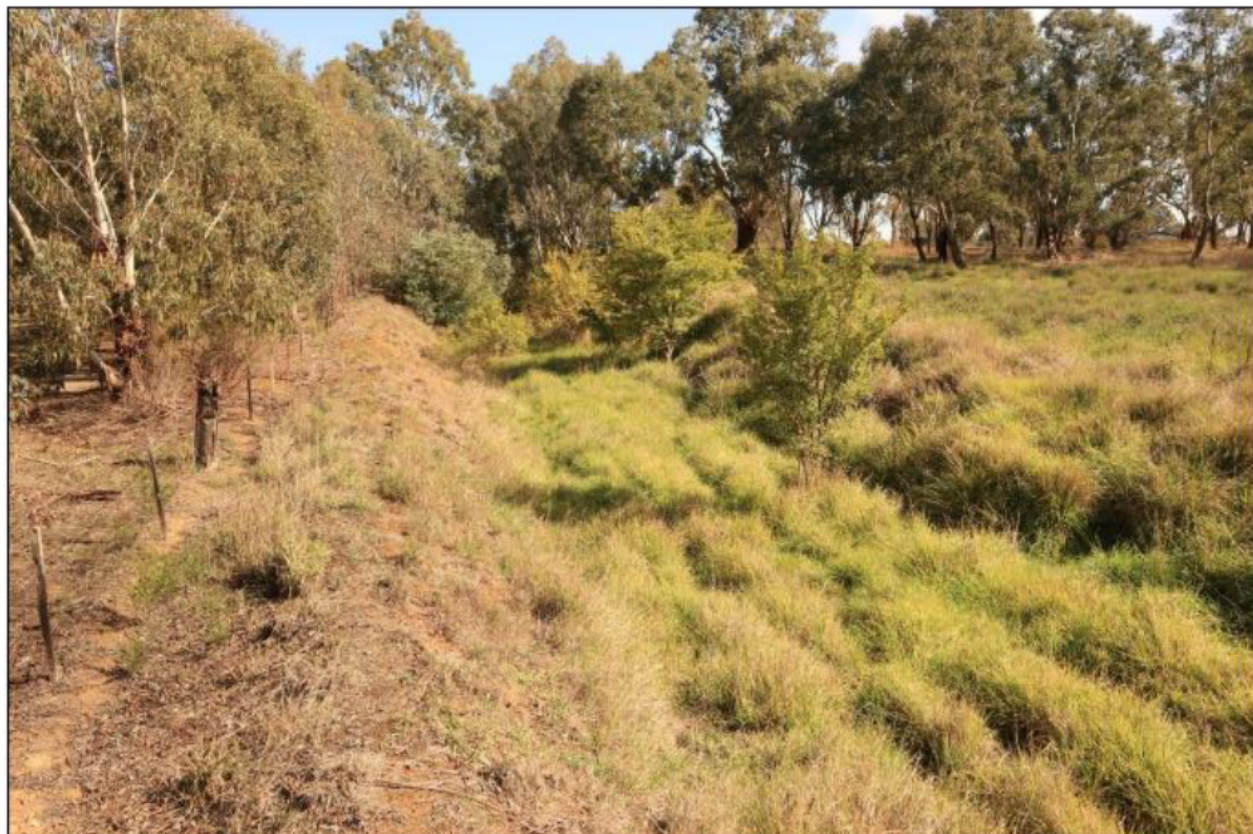
Original rail alignment with regrowth vegetation leading West to Withers Lane, April 2020