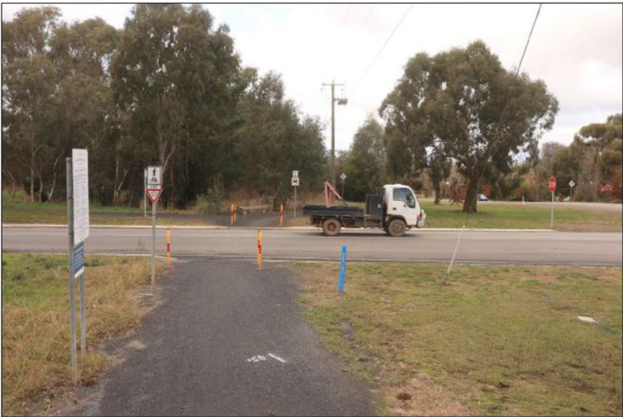
Rail trail crossing at Withers Lane looking East as currently existing, May 2022