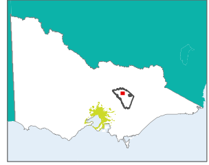
Part of Planning Scheme Map 12